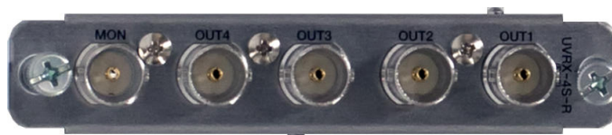
MD8000 – UVRX-J2K-2022 (SDI) – Electrical Rear Board Connectors