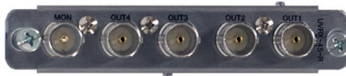
MD8000 – UVRX-2022 (SDI) – Electrical Rear Board Connectors